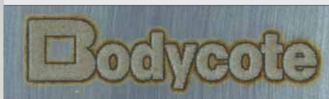
Subsequent laser engraving of an S 3 P-treated component; spatters and tempering colours on the surface. (Parameters: P 20 W/ 50 %/ f p 32 kHz/ t p 144 ns/ E p 0.63 mJ/ v s 1.3 ms -1 )