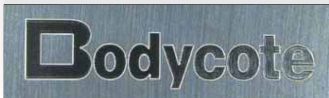
Subsequent laser remelting of a S 3 P-treated component; relatively low contrast simultaneously with positive corrosion properties. (Parameters: P 20 W/ 50 %/ f p 200 kHz/ t p 60 ns/ E p 0.37 mJ/ v s 0.8 ms -1 )