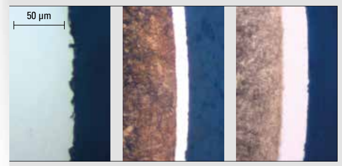
Fig. 3 Metallographic cross section of untested springs in different conditions: Shot peened (non-etched) – Kolsterising® K10 – Kolsterising® K33 (etched). With shot peening, gaps and notches are generated while S<sup>3</sup>P Kolsterising® creates a bright, precipitation-free diffusion zone of 11 μm (K10) and 29 μm (K33).

Fig. 2 Fatigue failure test results of 1.4310 (AISI 302) stainless steel coil springs with 1.6 mm (.063") wire diameter, 15.6 mm (.615") outer diameter and 279.4 mm (1.10") free length in different conditions: untreated – shot peened – S<sup>3</sup>P Kolsterising<sup>®</sup> K10 – S<sup>3</sup>P Kolsterising<sup>®</sup> K33. Test terms: 928.8 kg/m (52lbs/in) spring rate, 12.4 mm (.49") deflection (adjusted to 70 % of the wire's minimum tensile strength) and 360 cycles/min.