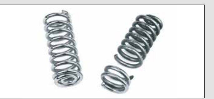
Fig. 1 Unused spring (left). Aged and fractured spring (right).

S<sup>3</sup>P – Specialty Stainless Steel Processes Spring Applications