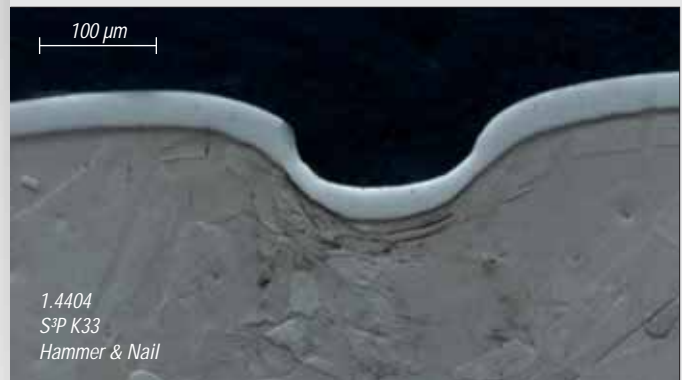
Fig. 2 No cracks visible in heavily deformed carbon S-Phase after hammer & nail test of S 3 P-treated AISI 316L.