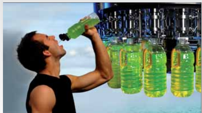
Fig. 3 Application example in the food and beverage industry. Bodycote S 3 P provides excellent wear and galling resistance while contamination due to delamination is eliminated.