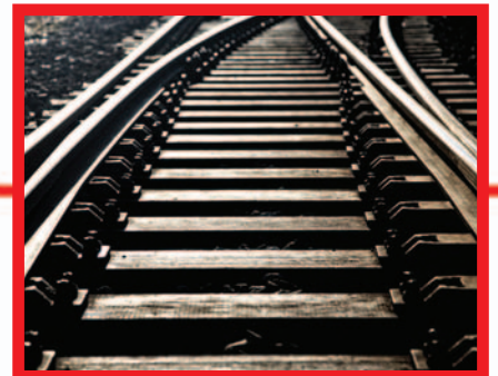
End application – railway lines

■ Finally, the clips are Sherardized to improve their life expectancy against environmental corrosion, without reducing their fatigue life