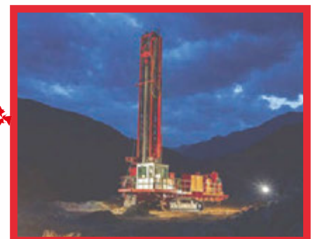
End application - rotary blasthole drilling rigs.

The Bodycote 'B' next to a component journey stage shows where Bodycote's vital services have been applied.