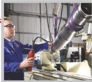
B The component is surface machined using diamond tools due to the extreme hardness of the surface finish.