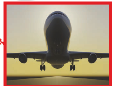
End application – aircraft.