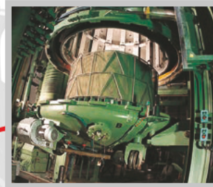
B The part is heat treated to harden and temper the steel.