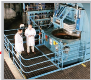
The implants are then HIPed to eliminate porosity, improve fatigue life and enhance the bonding of the biocompatible coating.