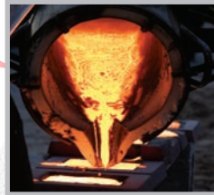
Cobalt chromium alloy billets are investment cast to form implant shape.

The stress on a hip or knee joint when a person jumps off a chair is equal to around 100 tonnes per square inch. Our bones, effectively composites, absorb such stresses regularly and effectively for much of our lifetime. When joints fail, they are often replaced with metal alloy implants. These implants must be incredibly strong, biocompatible, and able to last the lifetime of the patient. A combination of heat treatment, hot isostatic pressing and coating makes this possible.