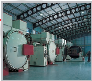
Solution and ageing heat treatment is used to strengthen the implant.