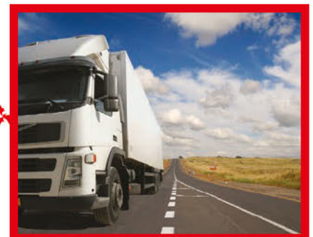
End application – truck engine.

B The Bodycote 'B' next to a component journey stage shows where Bodycote's vital services have been applied.