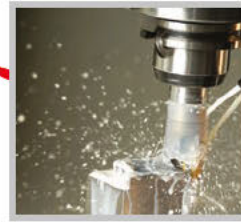
The injector is rough machined to within tight tolerance of its final size, adding fuel ports and passageways.

B Controlled gas nitriding gives the part very high surface hardness with minimum distortion, providing excellent wear and corrosion resistance.