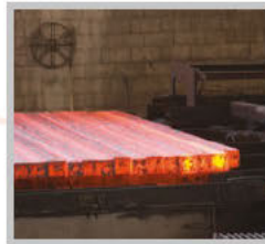
The injector begins life either as an alloy steel forging or steel bar.

Injector part failure due to wear is a costly hazard, leading to potential damage to other areas of the engine. The diesel injectors shown in this example are used in trucks, and each truck can have between 6-12 injectors. As part of the manufacturing process, the part must go through various thermal processing stages to enable it to perform to the required standard in service.